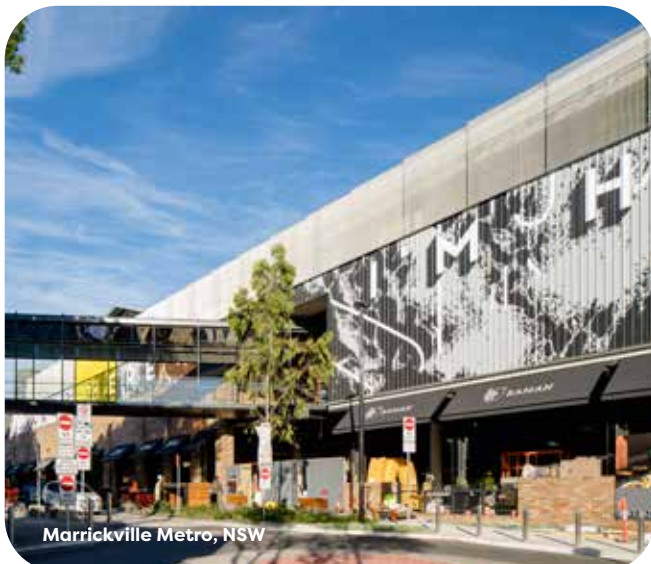
Marrickville Metro, NSW

It runs deep in our DNA and remains one of our largest markets. Greenfield developments, major extensions and detailed refurbishments continue to illustrate our ongoing contribution to Australia's evolving retail landscape. We deliver projects for the REIT sector, direct retailers, and key private clients.